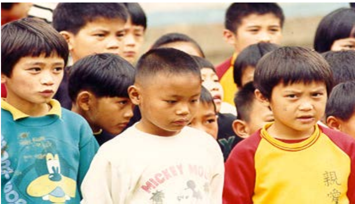
Kids in Taiwan being preached to by a Missionary

"Let's quit fiddling with religion and do something to bring the world to Christ." ~ Billy Sunday