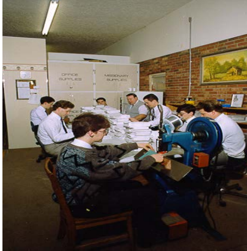
Collating the Scriptures